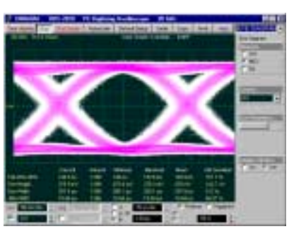
An Informative Waveform Display with Grey Scaling

UDS-2000 instruments are PC-Sampling Oscilloscopes, or oscilloscopes for Personal Computer. They require just USB 2.0 (FS) or IEEE1284 (ECP mode) connector in your PC to give you the computing power of a stand-alone instrument within your PC.