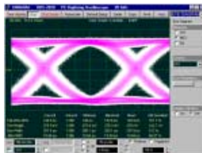
An Informative Waveform Display with Grey Scaling

UDS-2000 instruments are PC-Sampling Oscilloscopes, or oscilloscopes for Personal Computer. They require just USB 2.0 (FS) or IEEE1284 (ECP mode) connector in your PC to give you the computing power of a stand-alone instrument within your PC.