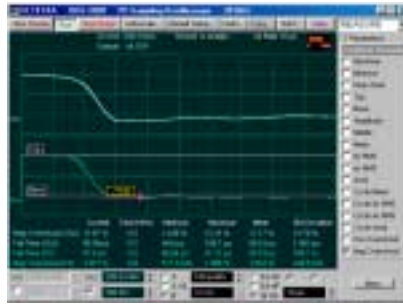
TDR Normalization. The top waveform shows distortions caused by cables and connectors. The bottom waveform shows how normalization corrects for these distortions.

Cursors will also read in voltage, percent reflection, ohms, time or distance.